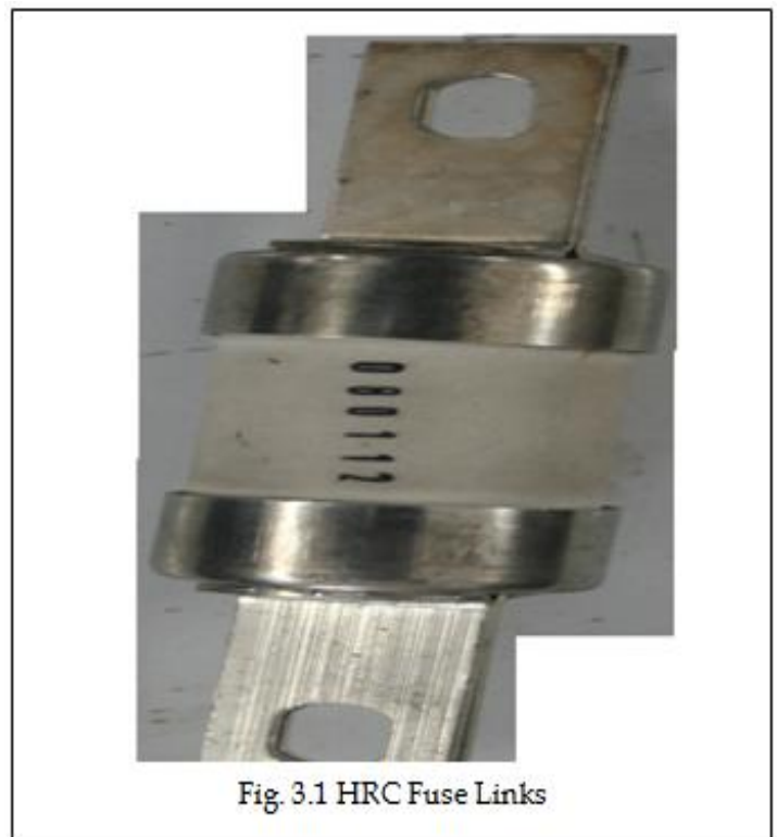
Fig. 3.1 HRC Fuse Links

These are very low in weight and also unbreakable. The detective and mechanical strength is too high and insulation resistance is more after overloading and short circuits.